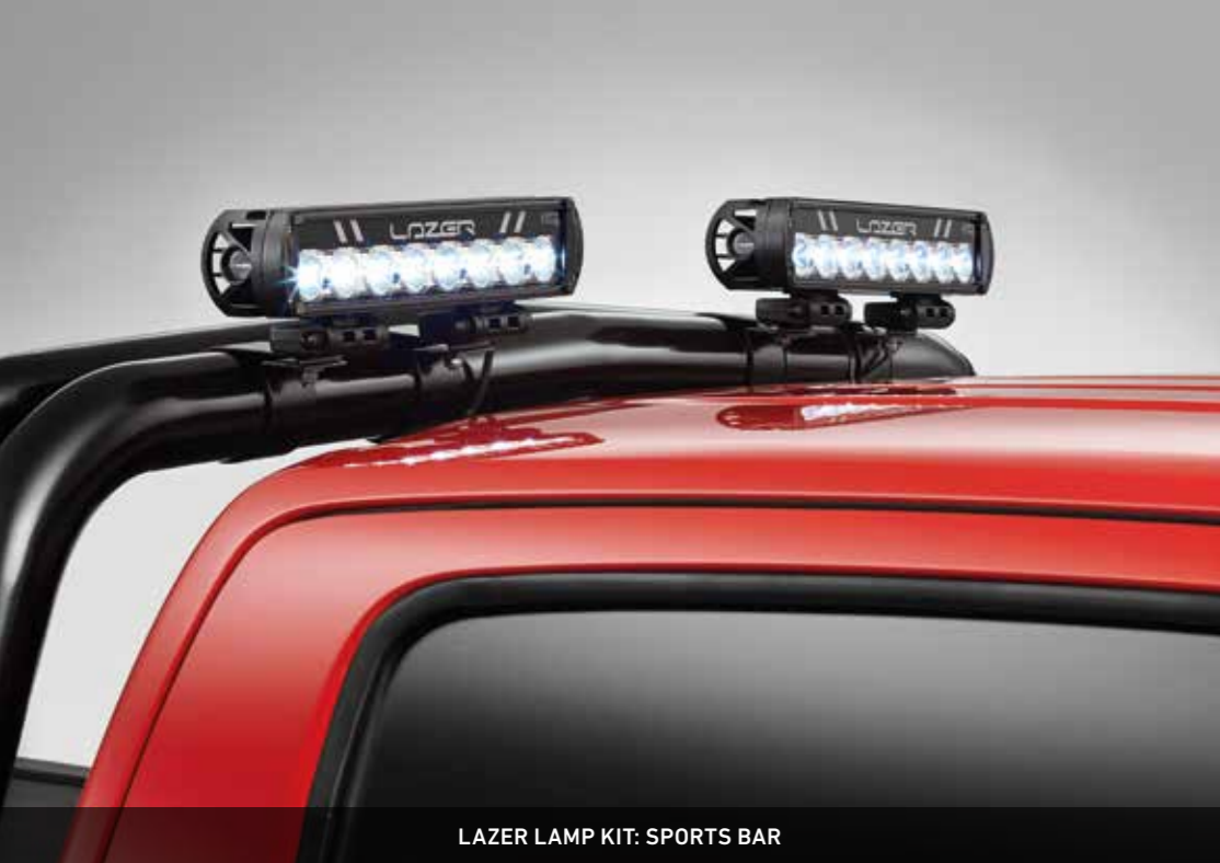
LAZER LAMP KIT: SPORTS BAR