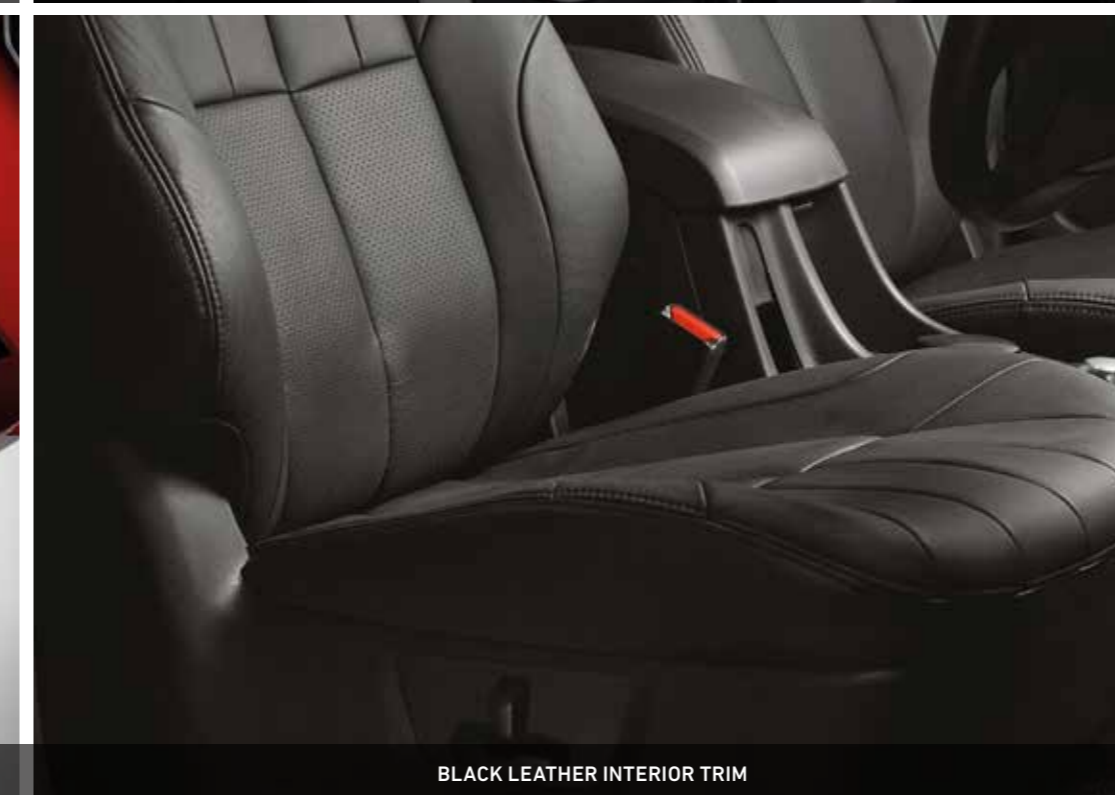
BLACK LEATHER INTERIOR TRIM