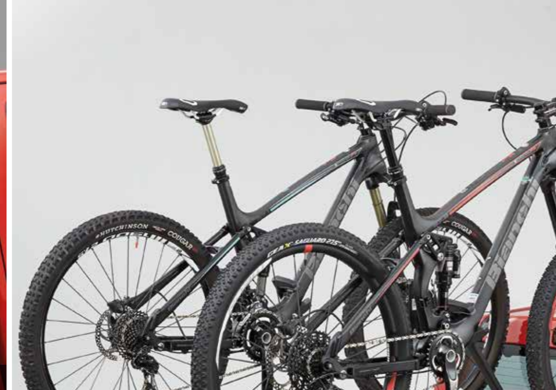
ALUMINIUM CYCLE CARRIER