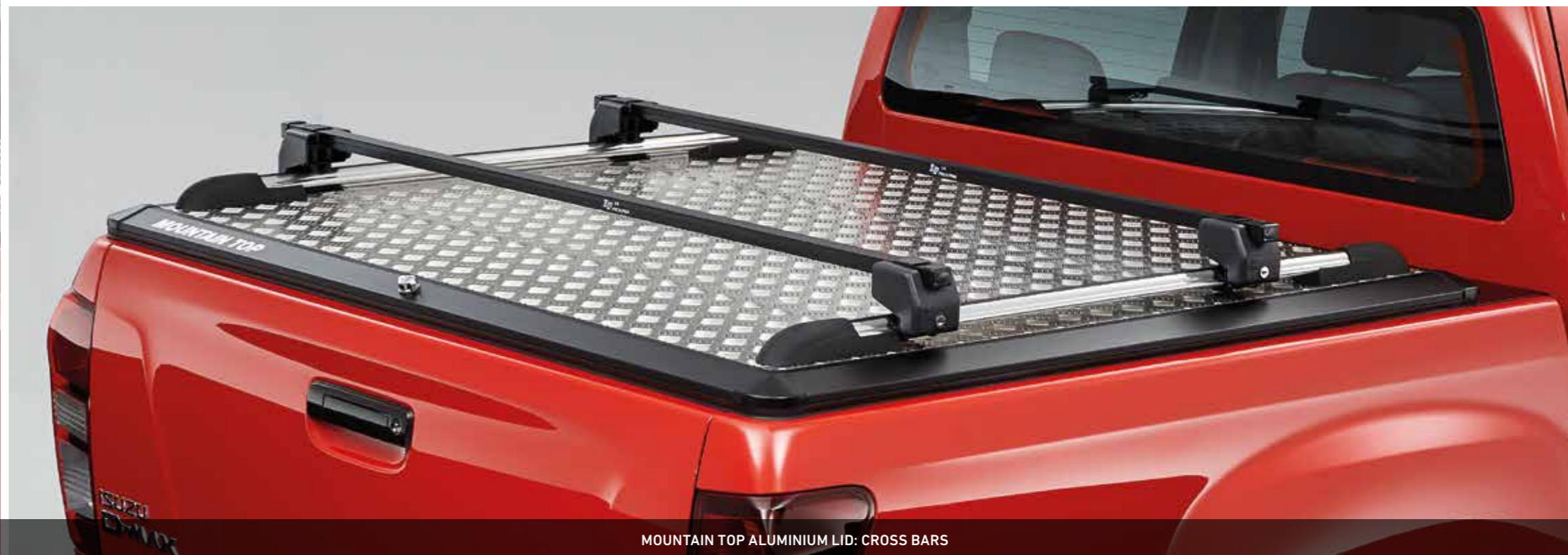
MOUNTAIN TOP ALUMINIUM LID: CROSS BARS