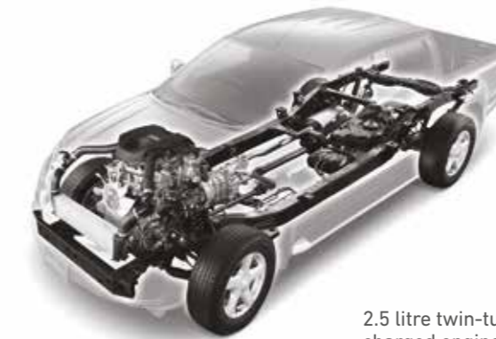
2.5 litre twin-turbo charged engine