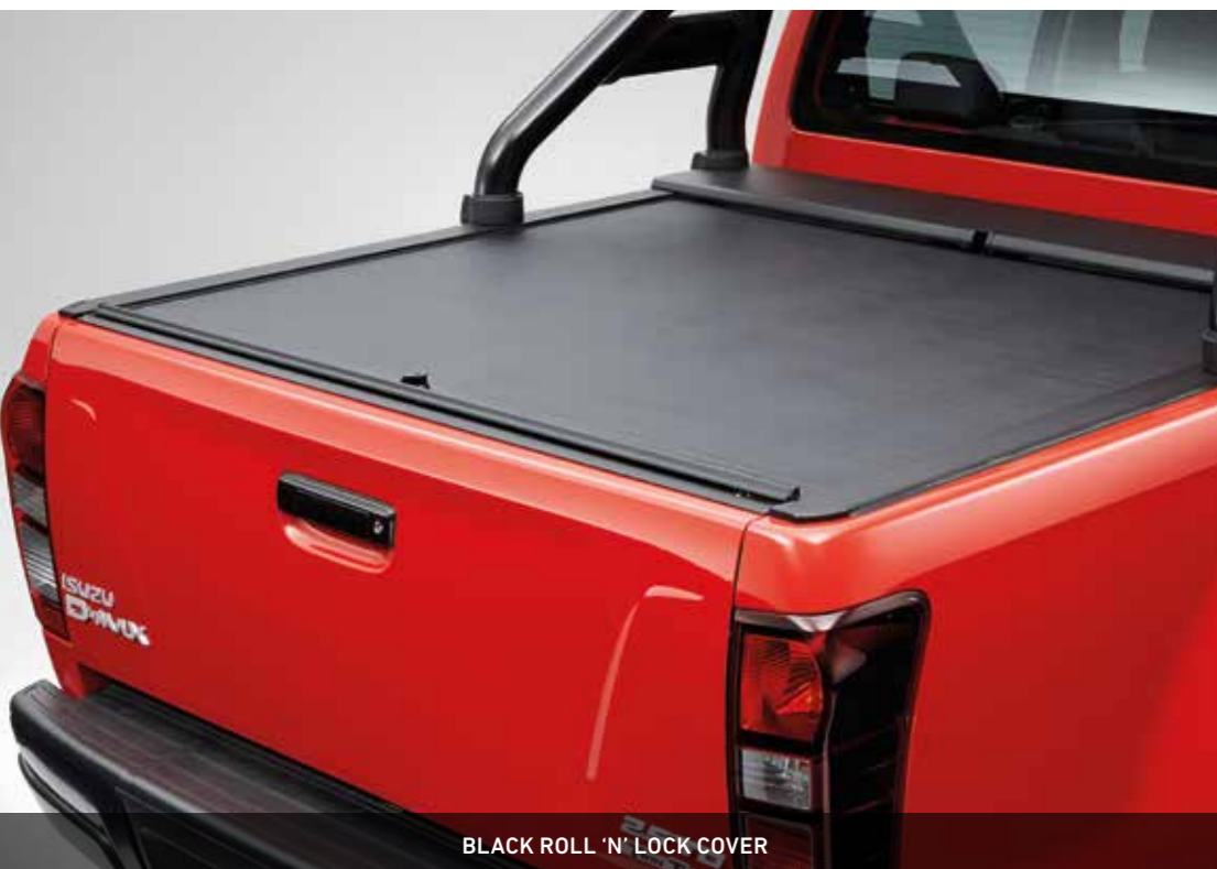
BLACK ROLL 'N' LOCK COVER