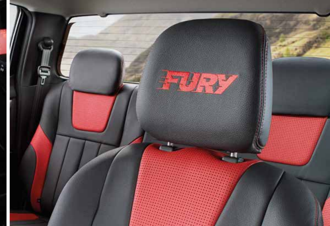
BLACK/RED FURY LEATHER INTERIOR TRIM