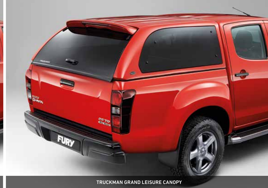
TRUCKMAN GRAND LEISURE CANOPY