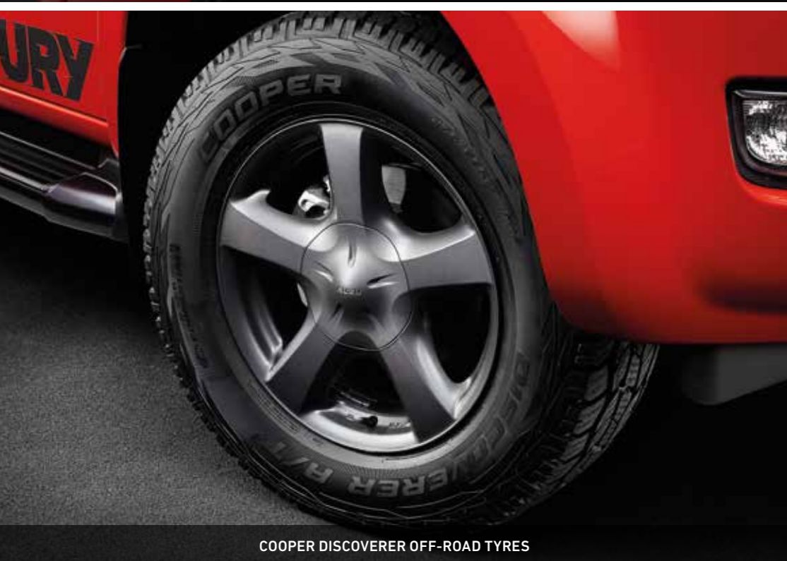
COOPER DISCOVERER OFF-ROAD TYRES