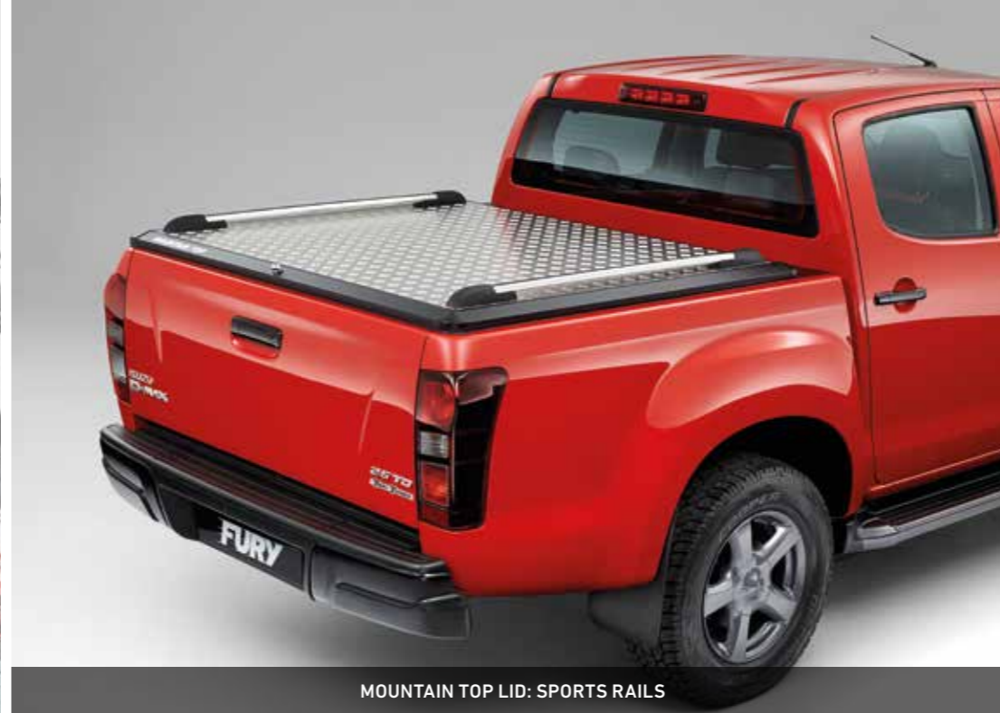
MOUNTAIN TOP LID: SPORTS RAILS