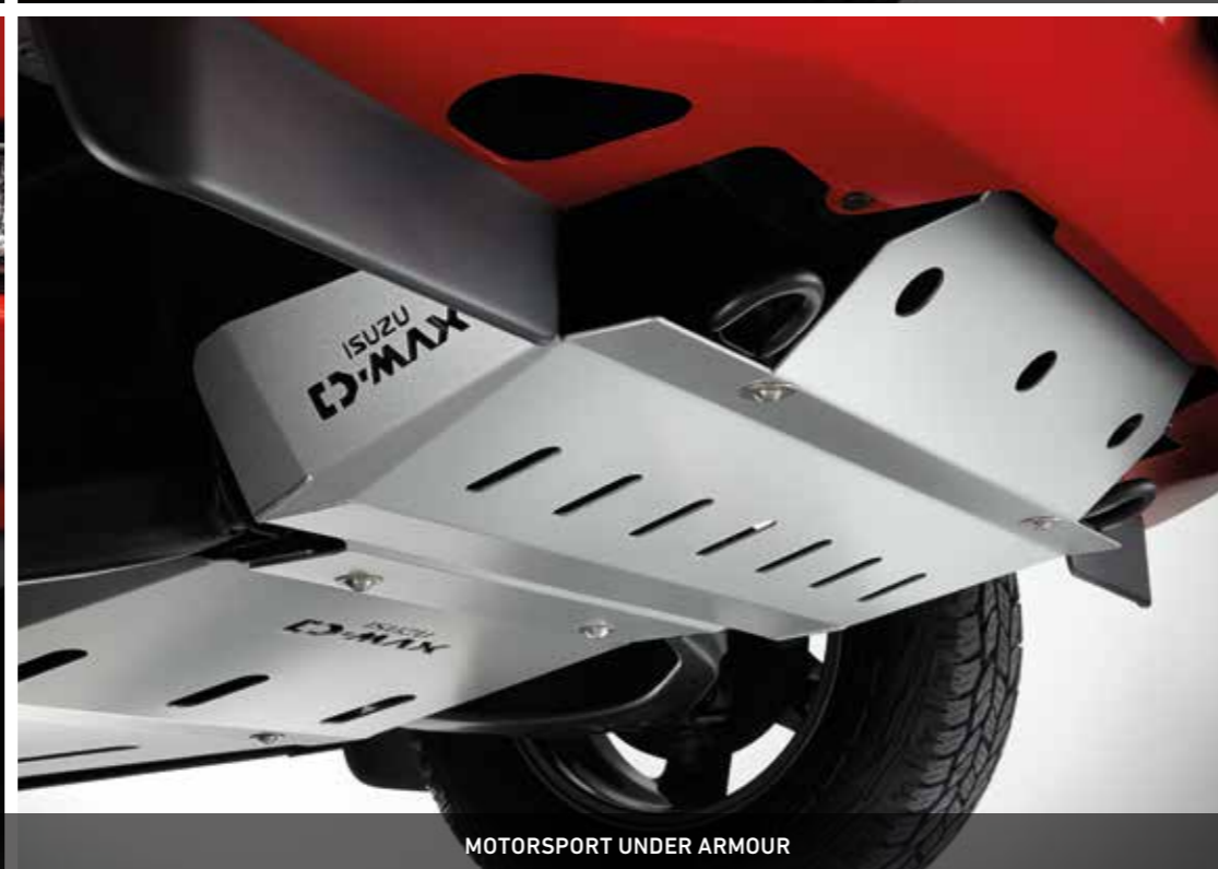
MOTORSPORT UNDER ARMOUR