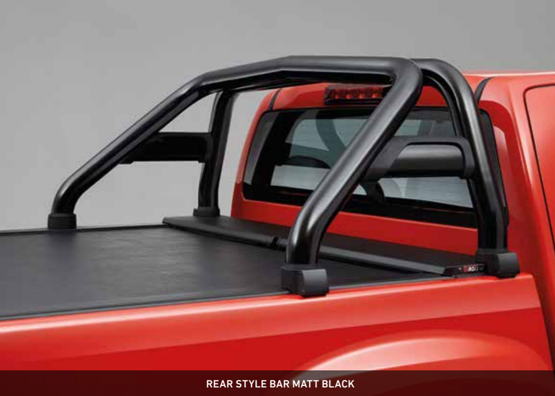
REAR STYLE BAR MATT BLACK