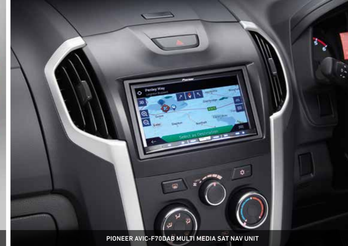
PIONEER AVIC-F70DAB MULTI MEDIA SAT NAV UNIT