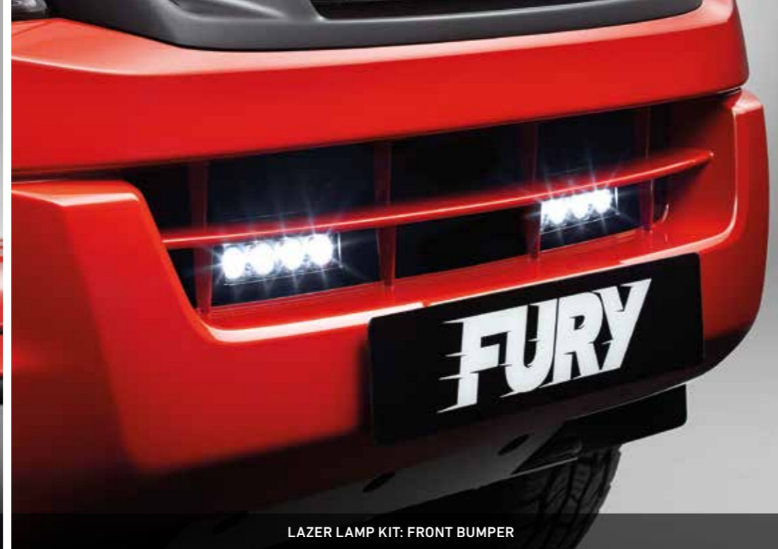
LAZER LAMP KIT: FRONT BUMPER