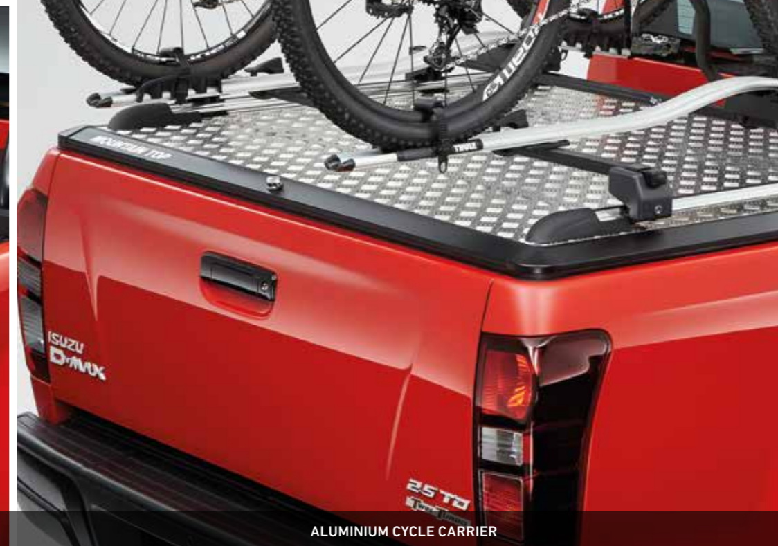
ALUMINIUM CYCLE CARRIER